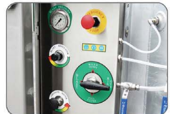
Patent pending engineered TRX Flow Dynamics