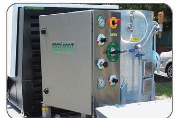
Safety inspired curb side control panel, for easy access.