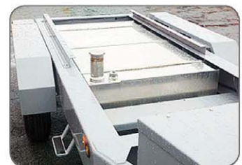
Trailer with built-in 95 gallon aluminum water tank.