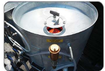
6.5-CF, hot-dipped galvanized, spring-sealed blast pot with auto vent.