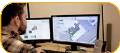
Engineering & Controls