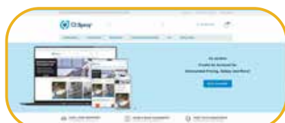
Online Ordering/Subscription Service