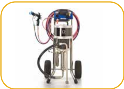
Air Assisted Airless