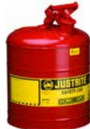
Solvent Cabinets & Containers