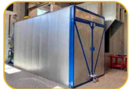
Ovens & Pretreatment