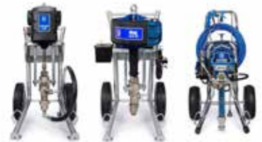
Single Leg Airless Pumps