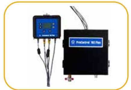
Flow Meters and Controls

Questions? Need Assistance? Call us toll-free at 1-888-CJSPRAY (257-7729)