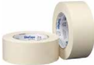
Tape & Masking Paper