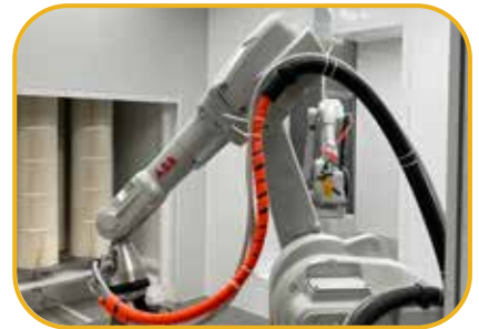
Robotics & Automation

Questions? Need Assistance? Call us toll-free at 1-888-CJSPRAY (257-7729)