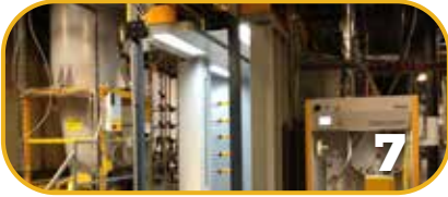
7 Powder Finishing