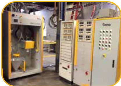
Powder Management Centers