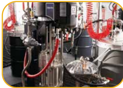
Paint Kitchen & Piping