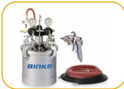
HVLP and Air Spray