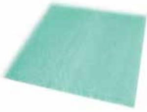
Liquid Booth Filters