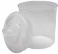
3M PPS Lids & Liners