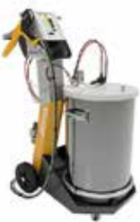
Manual Equipment and Guns

Whether you're new to powder coating and looking for your first manual box unit and batch oven, or if you are looking to fully automate your finishing operations with powder, we can help.