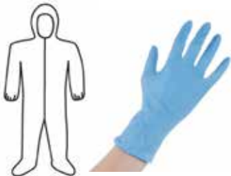
Coveralls & Gloves