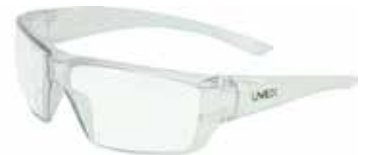
Eye/ Ear / Head Protection