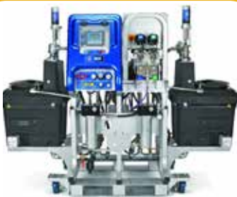
Variable Ratio Proportioners

Applying protective coatings provides unique challenges for finishing departments. CJ Spray and The Paint Project has the experience to help you achieve great finish results while maximizing productivity and reducing waste.