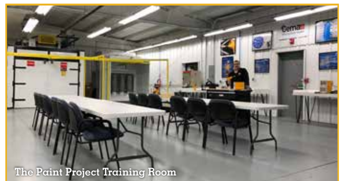
The Paint Project Training Room

CJ Spray, Inc. 2845 W Service Road Eagan, MN 55121 1-888-CJSpray www.cjspray.com