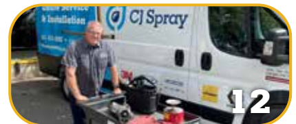
12 Local Support