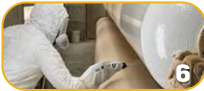
6 Liquid Paint Finishing