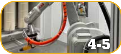
4.5 Finishing Systems