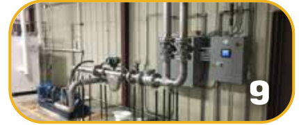
9 Material Transfer