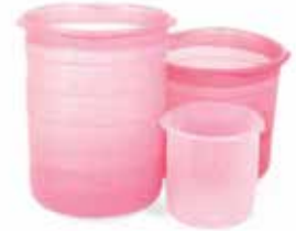
Pressure pot liners