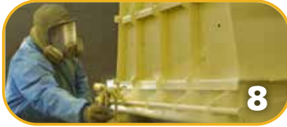
8 Protective Coatings