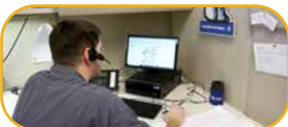
Technical Sales & Assistance