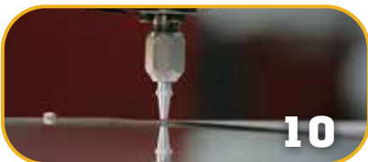
10 Sealant & Adhesive