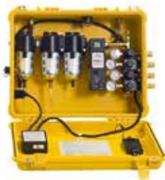
Fresh Air Supply