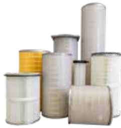
Powder Booth filters