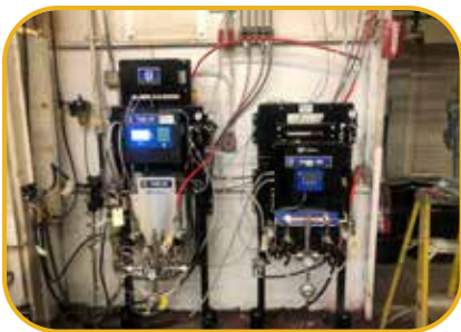
2K and 3K Proportioning

Liquid finishing is where we got our start. From pressure pots and spray guns to electronic proportioning with electrostatic guns, we have you covered. Our technical sales experts can recommend the right equipment for your material and application.