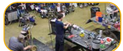
Service & Warranty Work