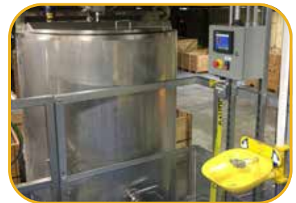
Tanks & Level Sensors