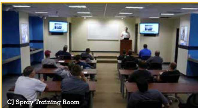
CJ Spray Training Room