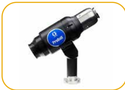
Bell Rotary Atomizers